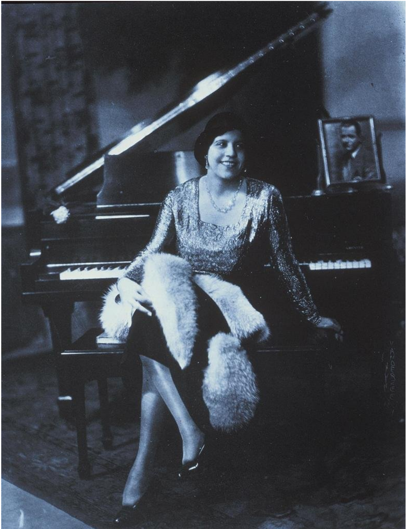
Portrait of Woman Seated At Piano.