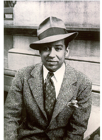
Langston Hughes

And sometimes goin' in the dark Where there ain't been no light. So boy, don't you turn back. Don't you set down on the steps 'Cause you find its kinder hard. Don't you fall now - For I'se still goin', honey, I'se still climbin', And life for me ain't been no crystal stair.