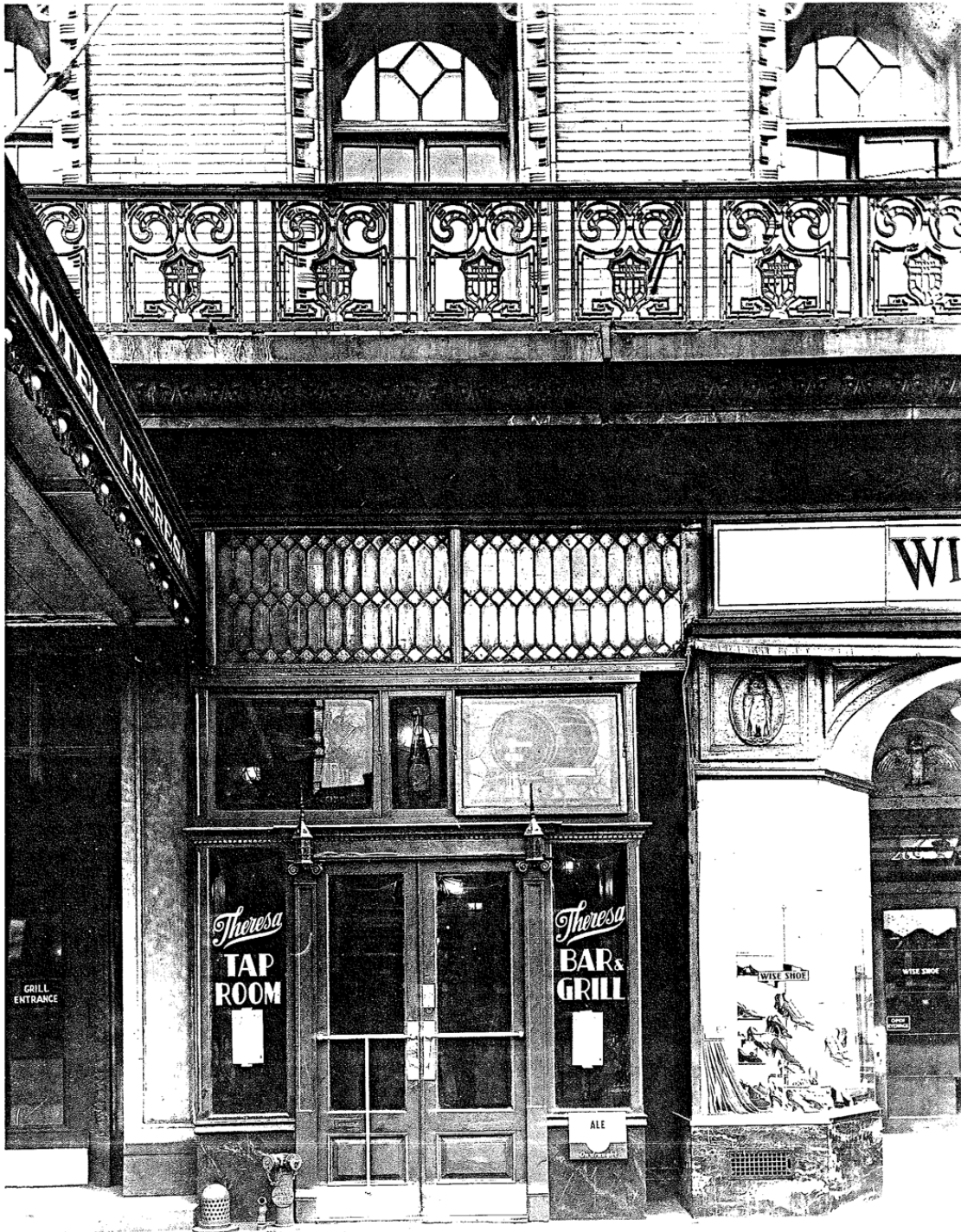
Theresa Bar & Grill, 1933.