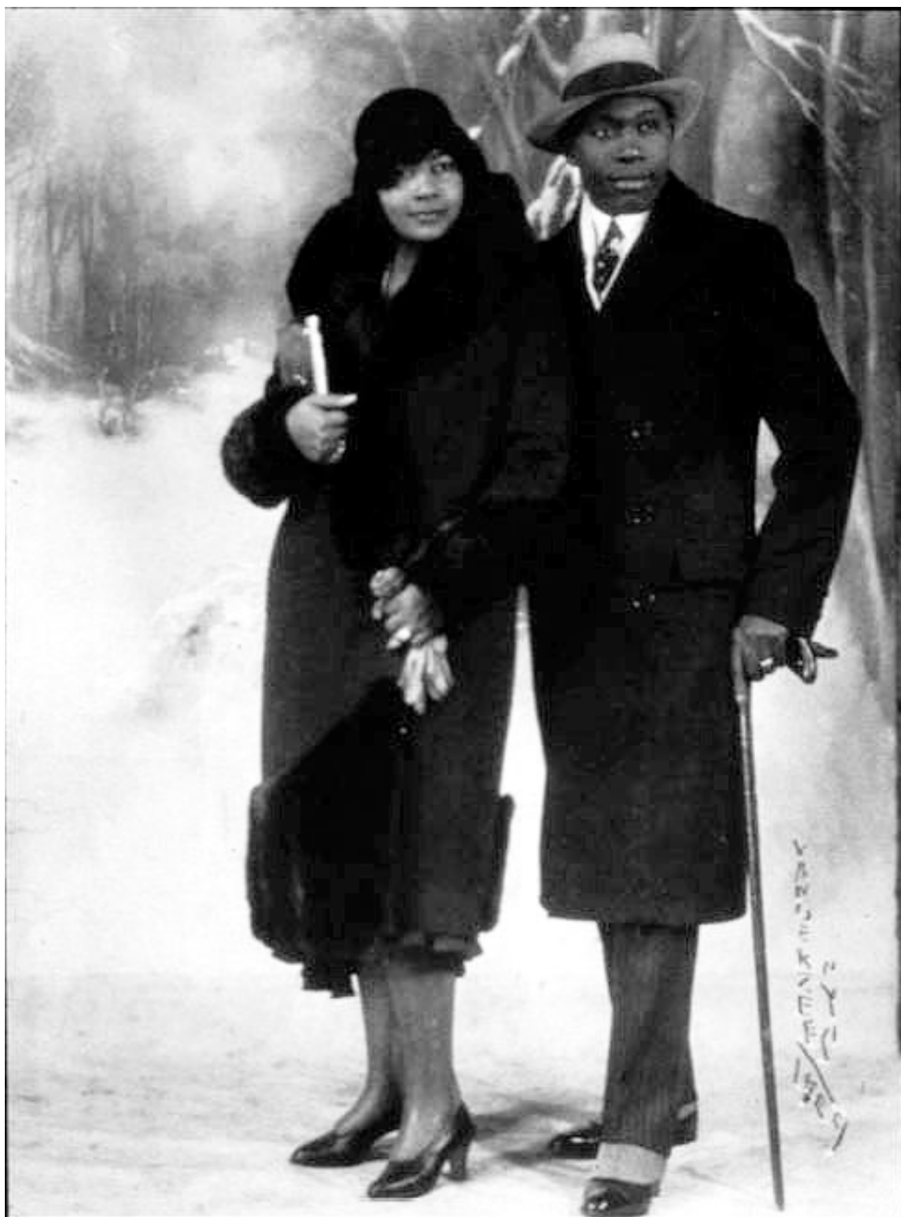
Portrait of Couple, Man With Walking Stick.