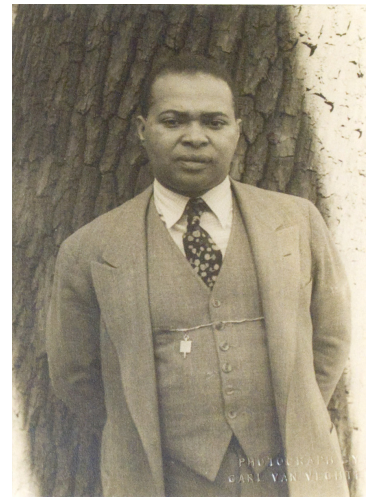
Countee Cullen, The Studio Museum in Harlem.