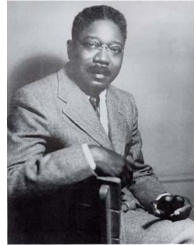
Aaron Douglas