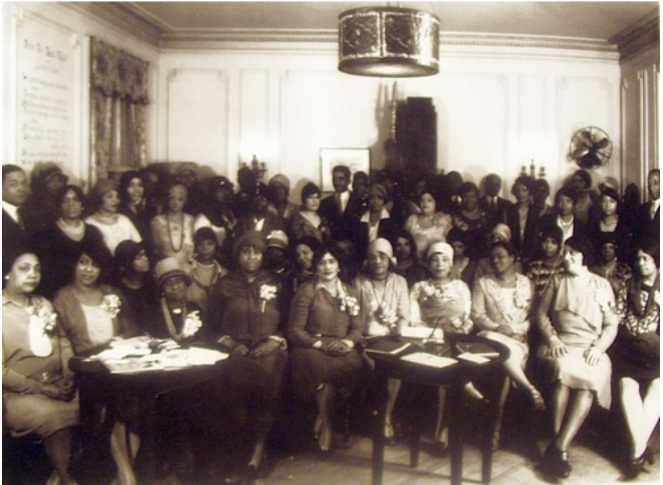
Group Portrait In The Dark Tower.